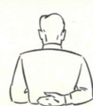
Illegal forward pass