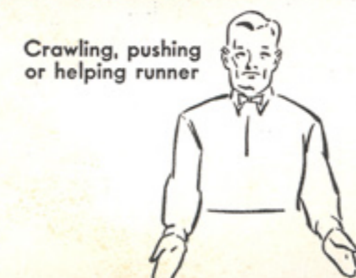
Crawling, pushing or helping runner