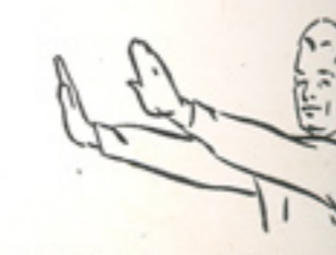
Interference with forward pass