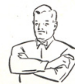
Delay of game or excess time out