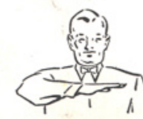
Illegal motion or formation at snap